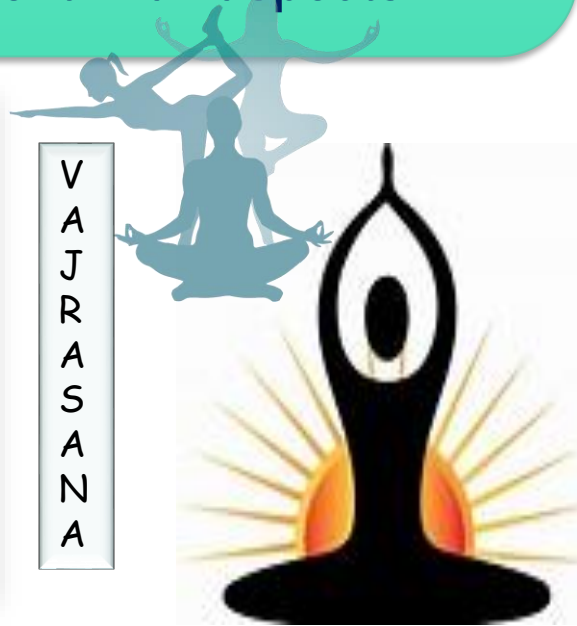
V A J R A S A N A