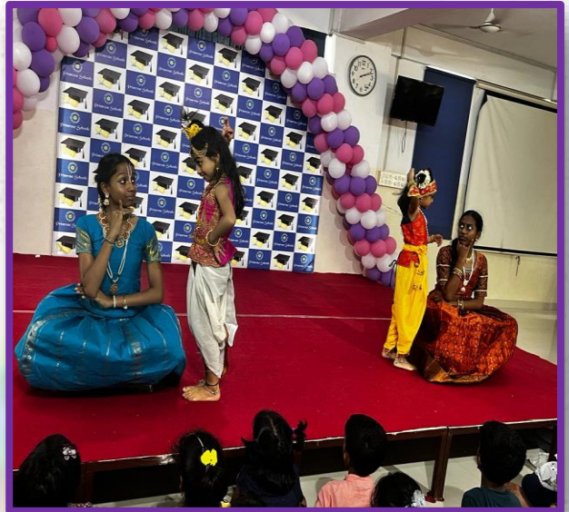
The mystic dance celebrating the cheerfulness at its brim in Lord Krishna's Presence.