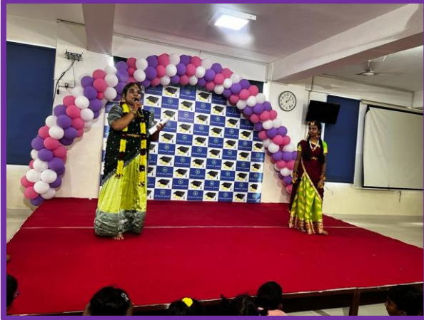
The eye-catcher of the show- Grade X girls' role play as Radhai and Kodhai