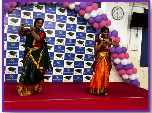
Graceful girls of Grade VIII giving the glory of Lord Krishna through dance.