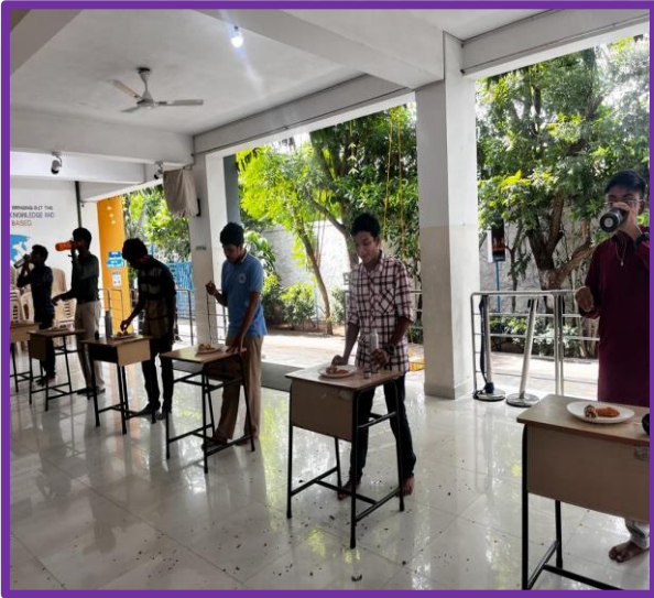
A tempting combat between the boys appeals not only the taste buds but also the onlookers.