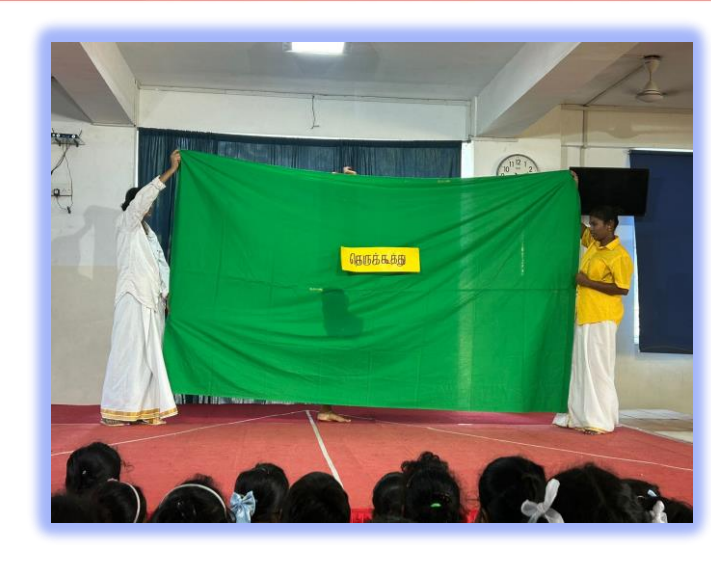
Theru Koothu, a cultural tapestry woven on the streets, tells tales of love, valor, and life's intricate dance.