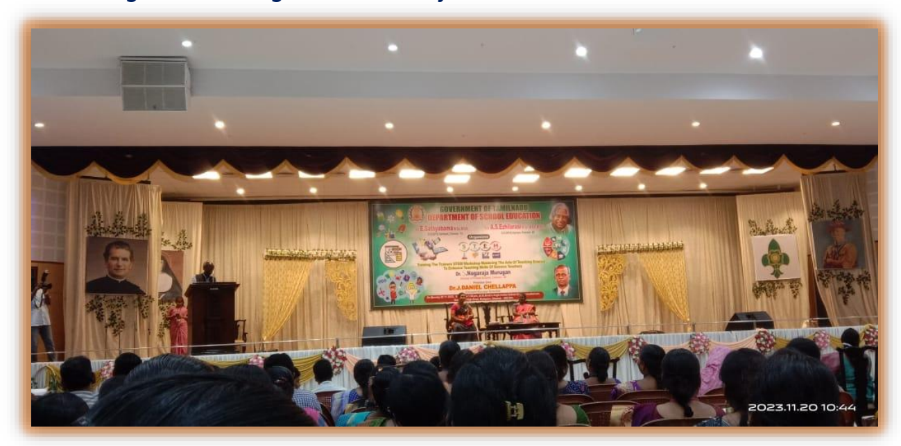
Teaching STEM is not just about conveying information; it's about nurturing curiosity, fostering creativity, and building the foundation for a future driven by innovation.

STEM Workshop - Organized by the Department of School Education at St. Bede's Anglo Indian Higher Secondary School.