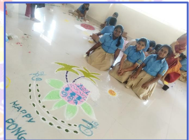
Kavipriya, Hasna Fathima, Haasini

On the morning of the competition, the courtyard was humming with anticipation as students started to show up with their materials. Each rice grain and colour powder was placed with great care as the pupils worked attentively and with intense concentration to construct their elaborate creations.