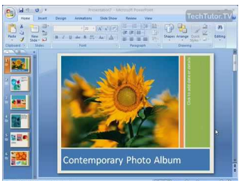
Figure out the picture of outline view 33.